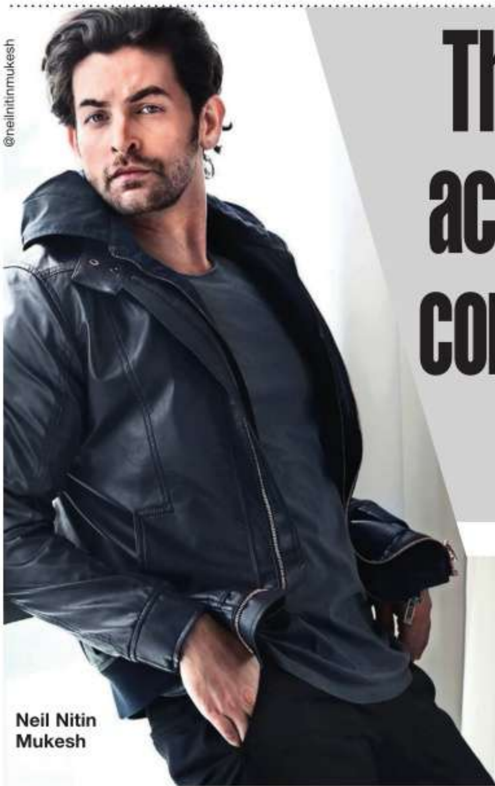
Neil Nitin Mukesh