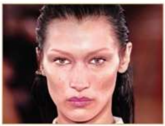
DECODING THE GOLDEN RATIO OF BEAUTY