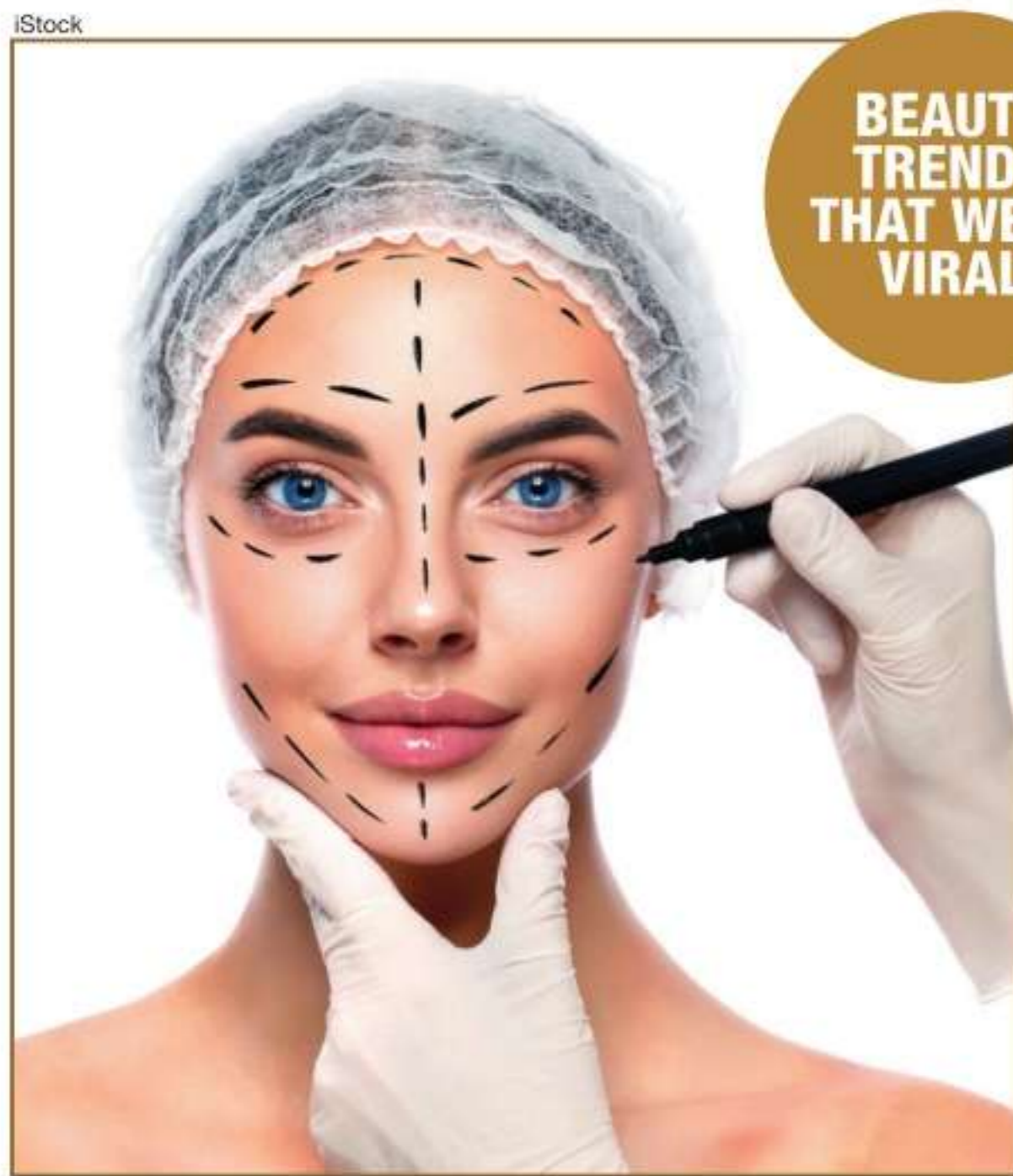
BEAUTY TRENDS THAT WENT VIRAL