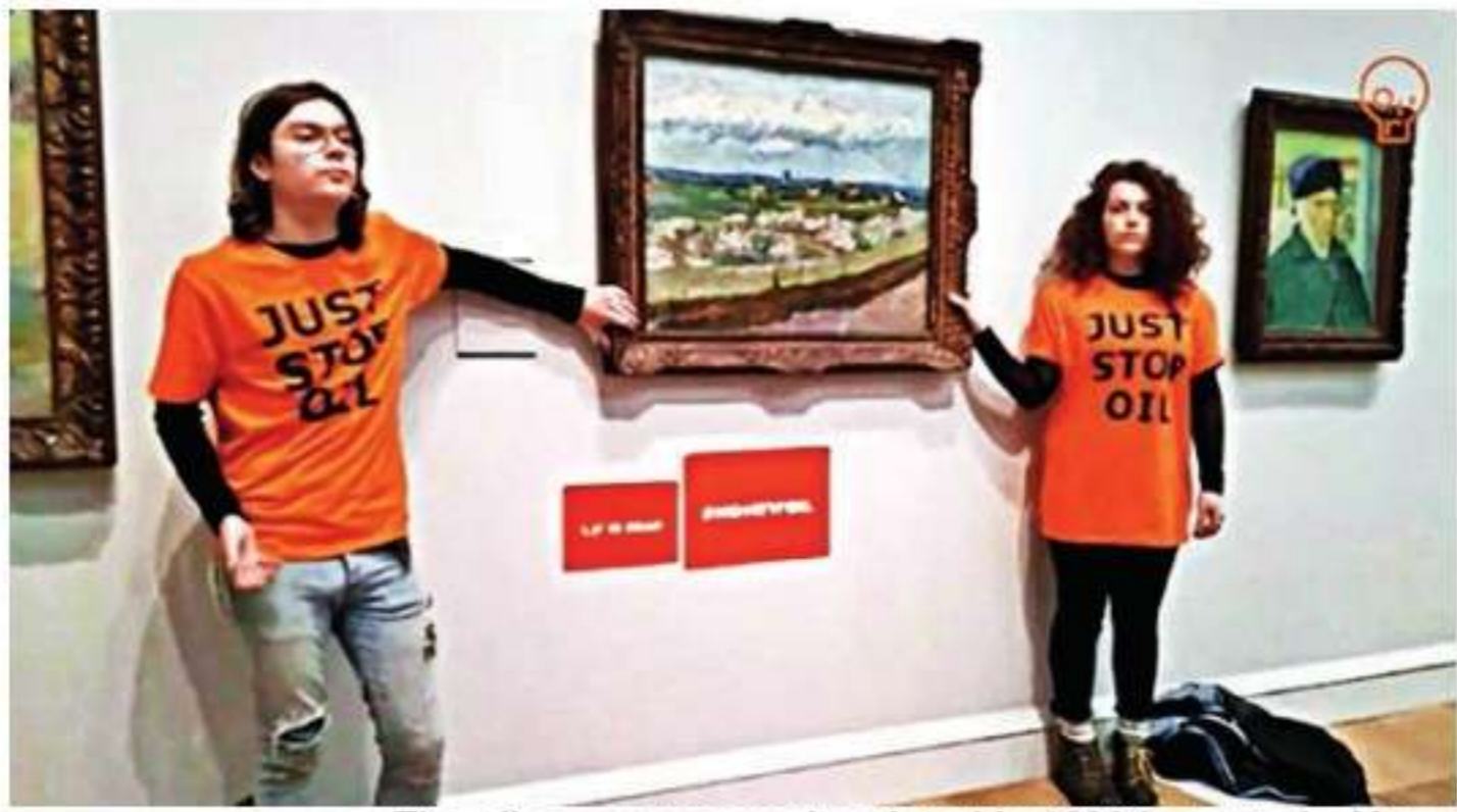
The oil on canvas work painted in 1889 is part of a Van Gogh collection hanging at the Courtauld Gallery in London

WE ARE GLUED TO THIS PAINTING BECAUSE WE ARE TERRIFIED FOR OUR FUTURE