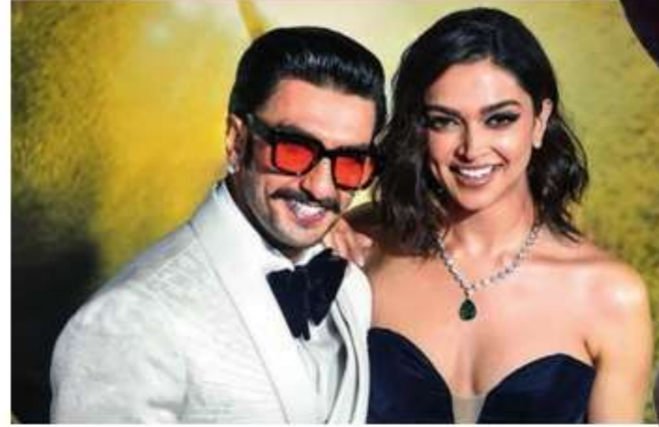
Siddhant Chaturvedi and (inset) Ranveer and Deepika

The actor, who has worked with both Deepika and Ranveer in different movies, shares what's unique about them