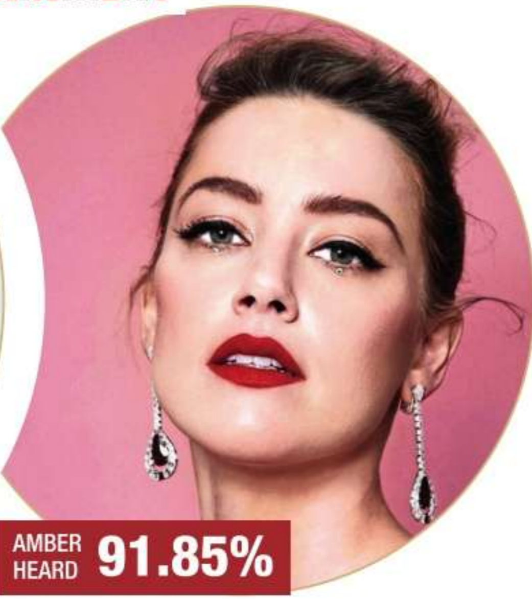
AMBER HEARD 91.85%