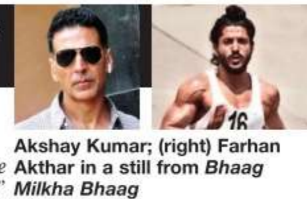
Akshay Kumar; (right) Farhan Akhtar in a still from Bhaag Milkha Bhaag

Farhan Akhtar's Bhaag Milkha Bhaag was one of the most successful films of 2013. But Farhan wasn't the first choice for the film; Akshay Kumar was. Akshay said, "I was offered Bhaag Milkha Bhaag , but I opted for Once Upon A Time In Mumbai Dobaara ... I regret not doing that film."