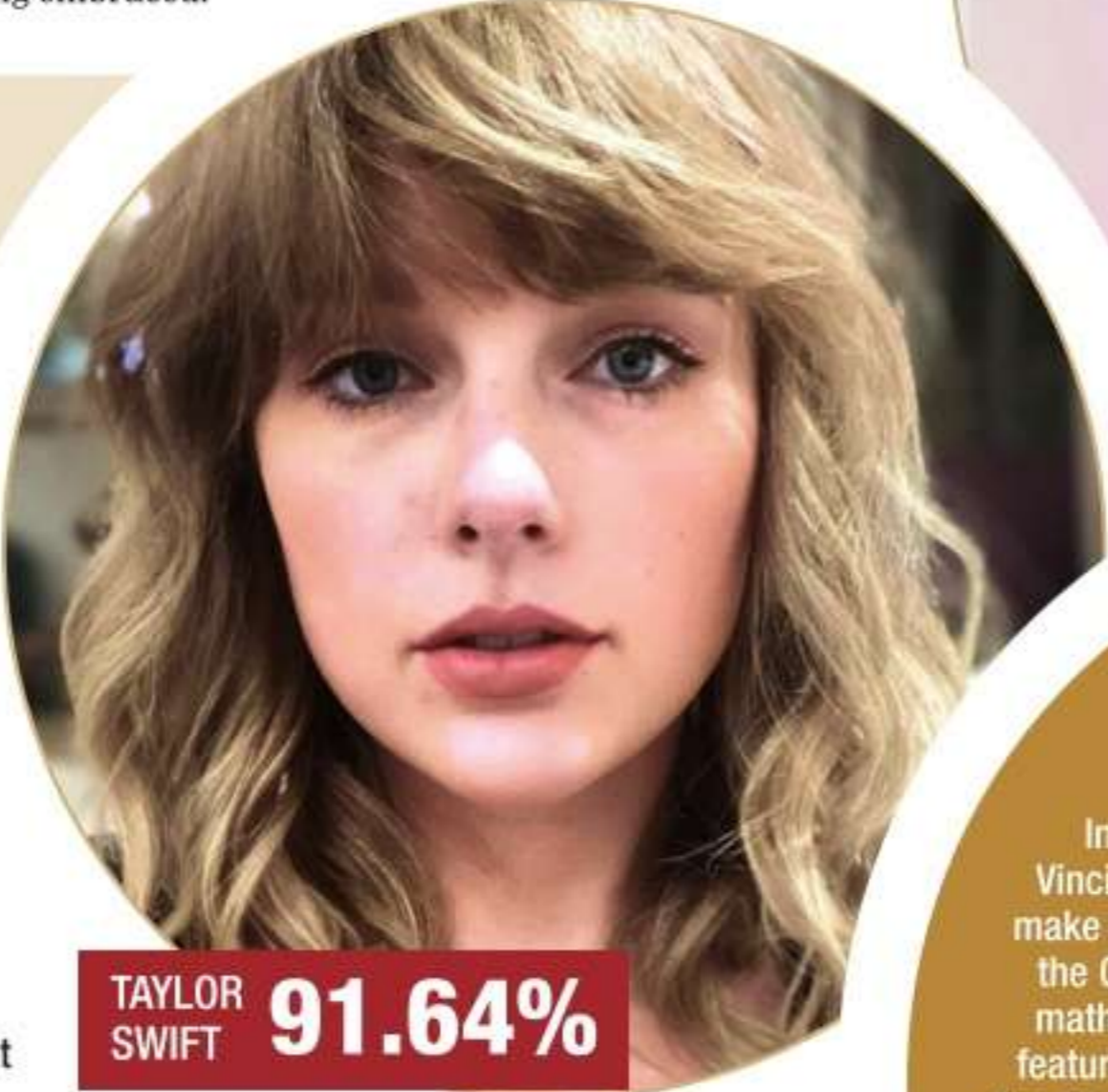
TAYLOR SWIFT 91.64%