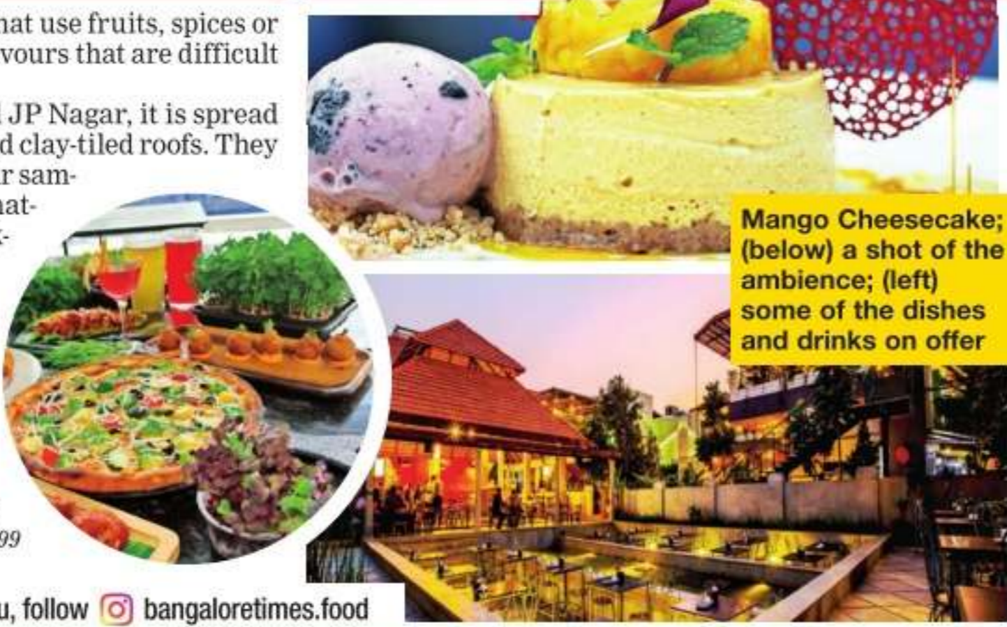
Mango Cheesecake; (below) a shot of the ambience; (left) some of the dishes and drinks on offer

Brahma Brews is at 35/38, 24th Main, 7th Phase, JP Nagar Call: 47112099