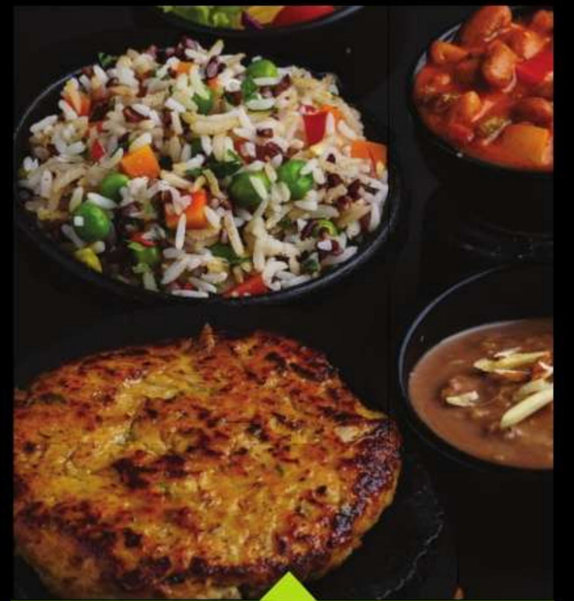
HIGH PROTEIN MEALS