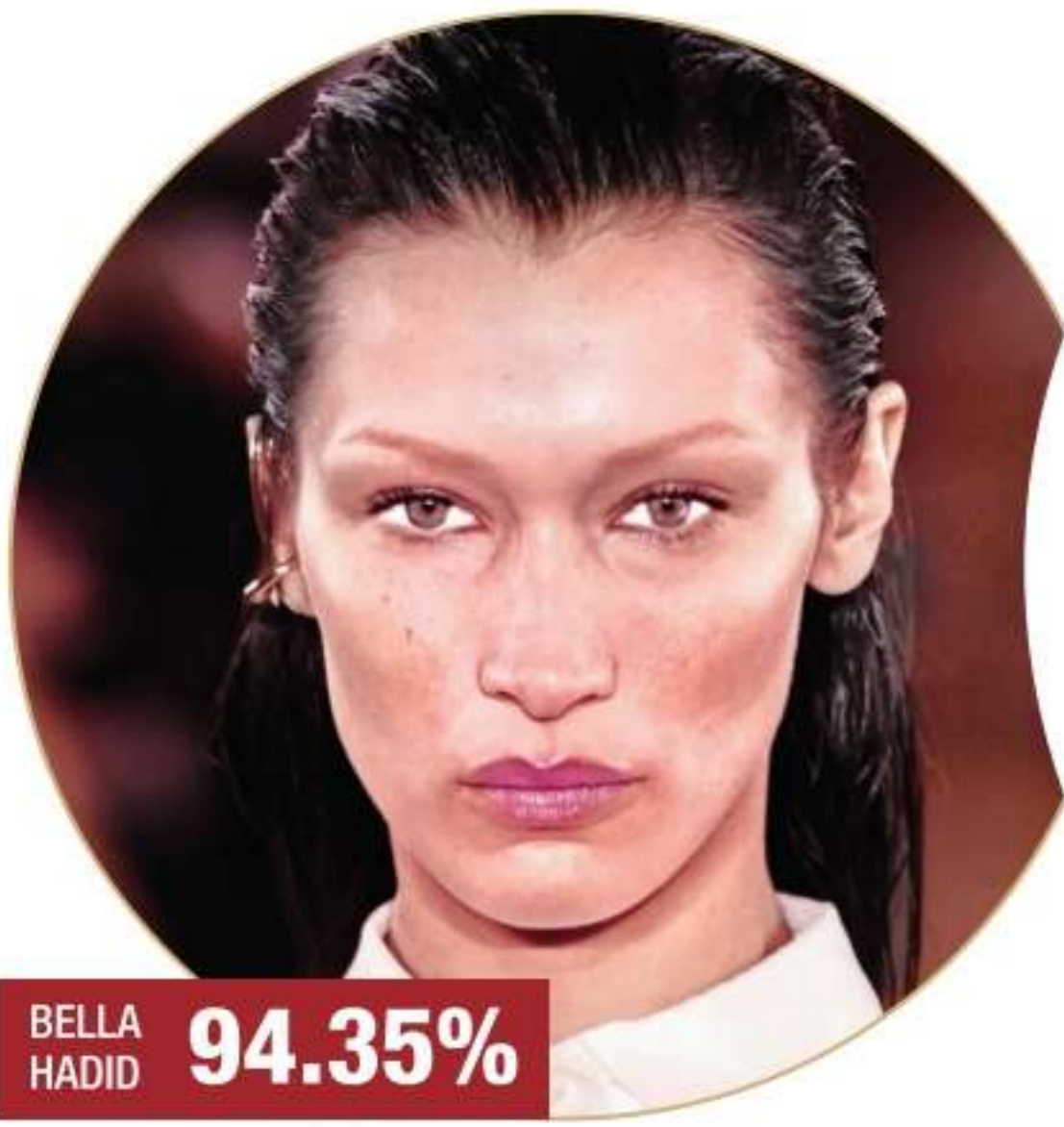
BELLA HADID 94.35%