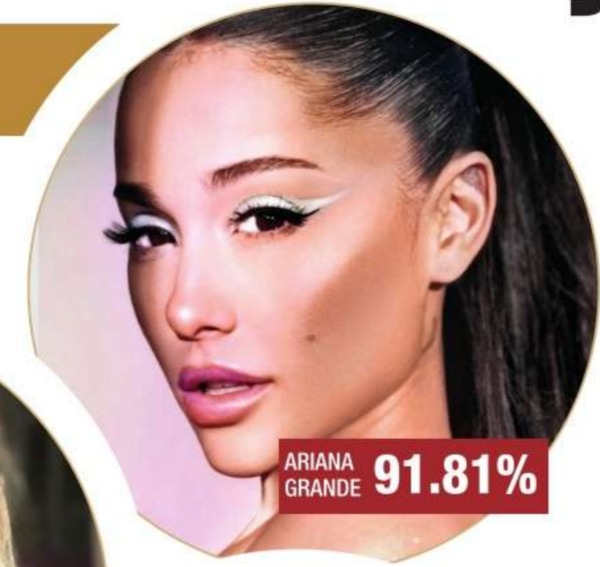
ARIANA GRANDE 91.81%

Thigh gap: Considered as an ideal shape of the legs where there is a visible gap between the thighs, and they no longer touch each other